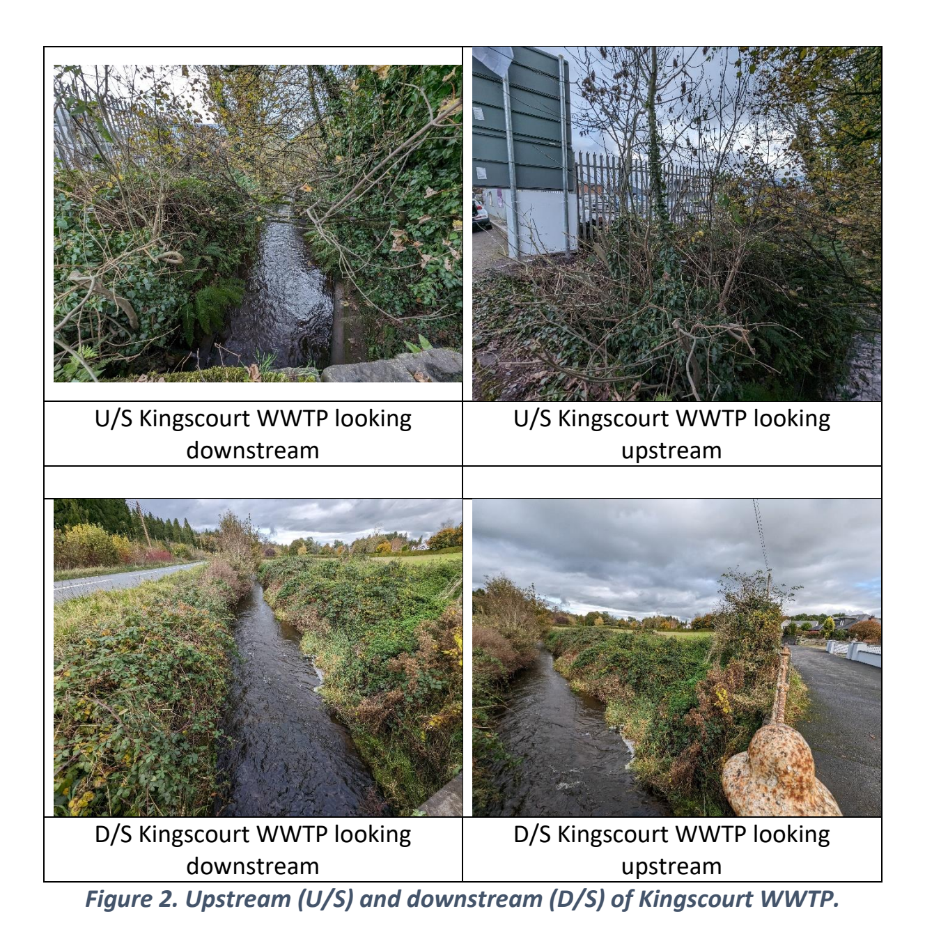
Figure 2 shows photographs taken when sampling at Site 1 and Site 2 upstream and downstream of the Kingscourt WWTP 0n 26 October 2023.