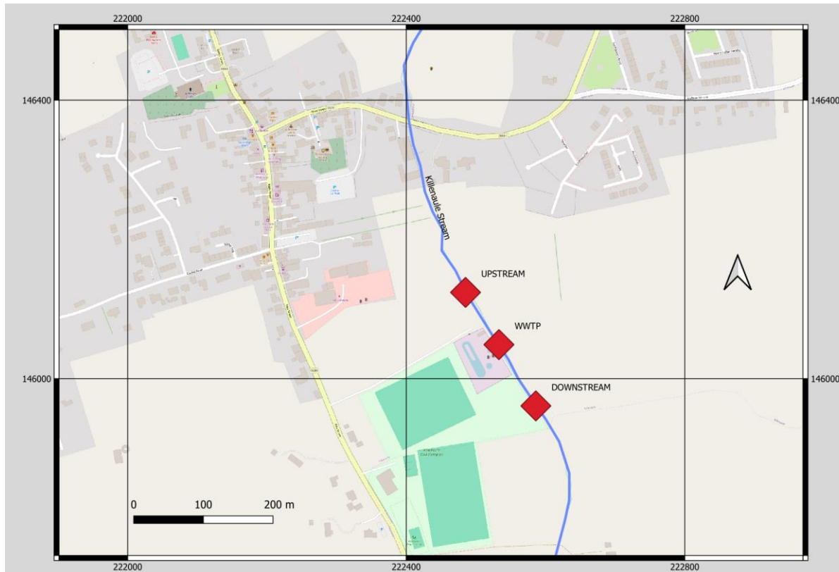
Figure 1. Location of upstream and downstream monitoring sites for Killenaule WWTP. The river flows South.

Figure 1 maps the sampling sites and Table 2 gives the details of the locations sampled.