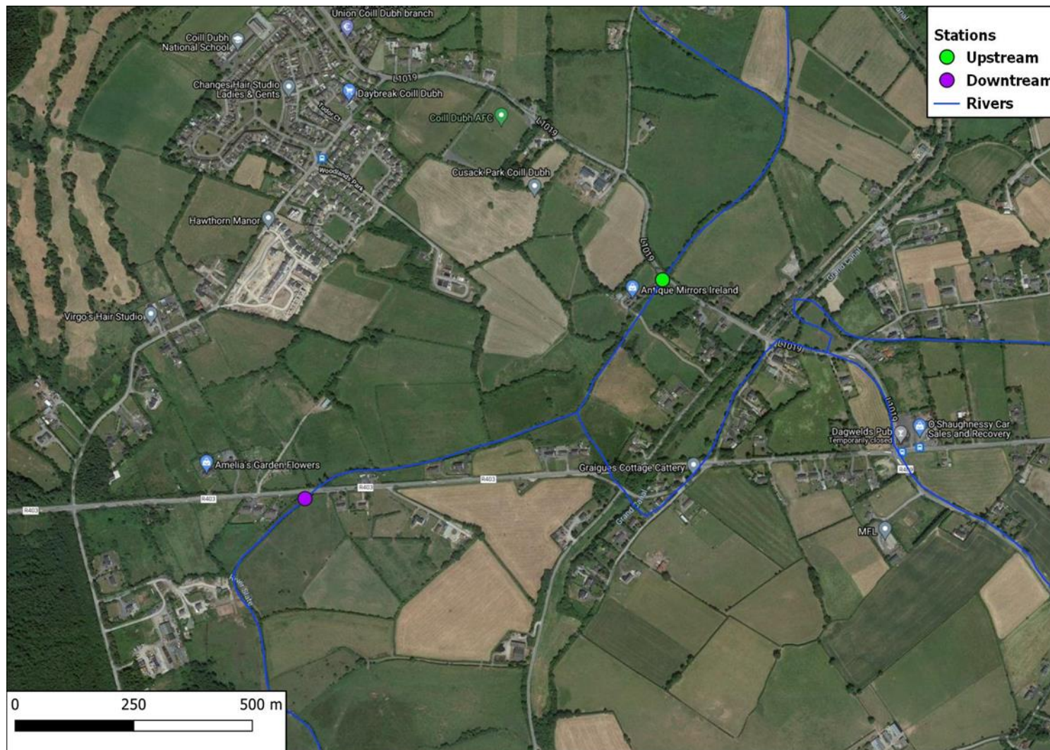
Figure 2.1: Coill Dubh SSRS sampling sites.