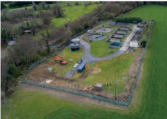
Aerial photo taken April 2019 before SWELL upgrade

Together, the SWELL and NI Water improvements at Warrenpoint WwTW will ensure an enhanced quality of effluent is discharged to Carlingford Lough.