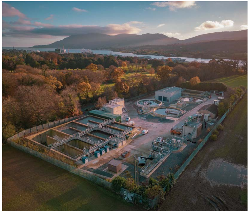
Aerial photo taken at Warrenpoint WwTW (Nov 2022) shows the phase 1 SWELL upgrade in the foreground along with the new tanks and UV treatment building constructed as part of the subsequent NI Water investment